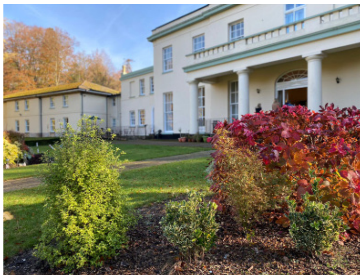
Brandon Park has been rated Excellent 2025

This fantastic result was awarded to Brandon Park, Melford Court, Stowlangtoft Hall and Manson House, each of which has been visited by inspectors under Suffolk's new local authority framework. This inspection process looks closely at areas such as safe staffing, the quality of care, and the cleanliness of the home environment.