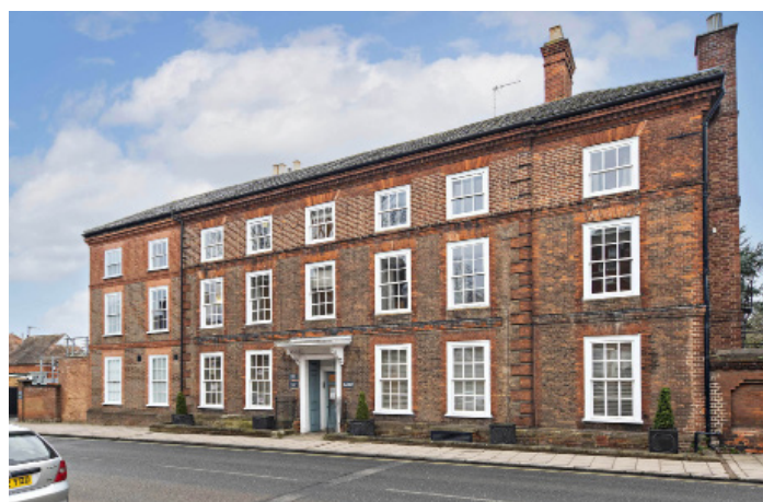
Manson House rated Excellent 2025

This success is a true reflection of the hard work, dedication and compassion shown by our teams every day – a standard of excellence that we are proud to see recognised across Suffolk.