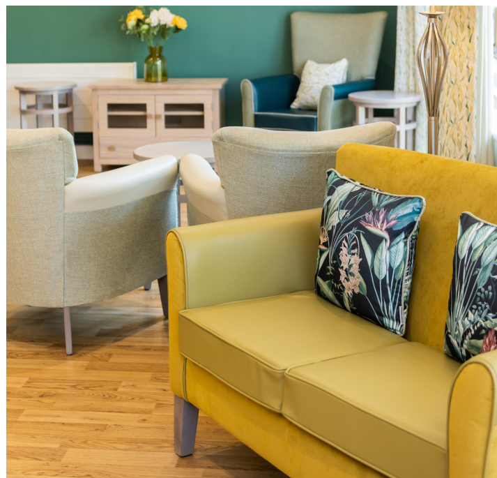
The Aspen Memory Centre is the second of Stow Healthcare's ground-breaking facilities to support expert memory care in East Anglia.

Willow Wing also hosts a gorgeous salon, perfect for having hair or nails done, and also has a variety of communal spaces including a spacious and relaxing lounge painted in soft greens.