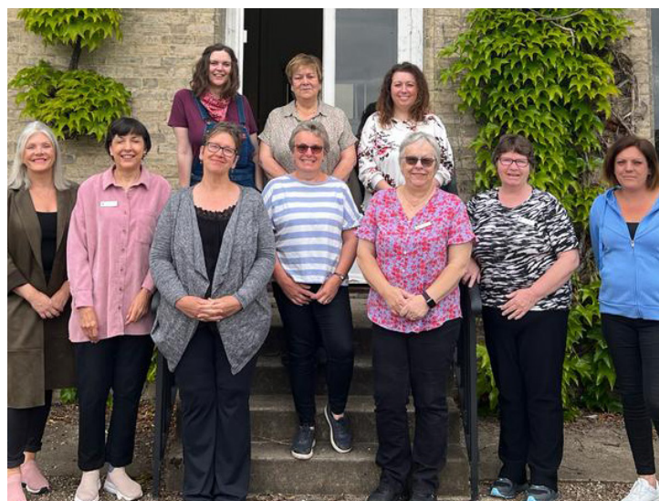
Activities Coordinators from across our homes attending the 2023 Activities Development Day

The return of in-person learning has allowed us to relaunch our department development days. In May, our activities teams from across the group gathered at Stowlangtoft Hall for our second annual Activities Development Day.