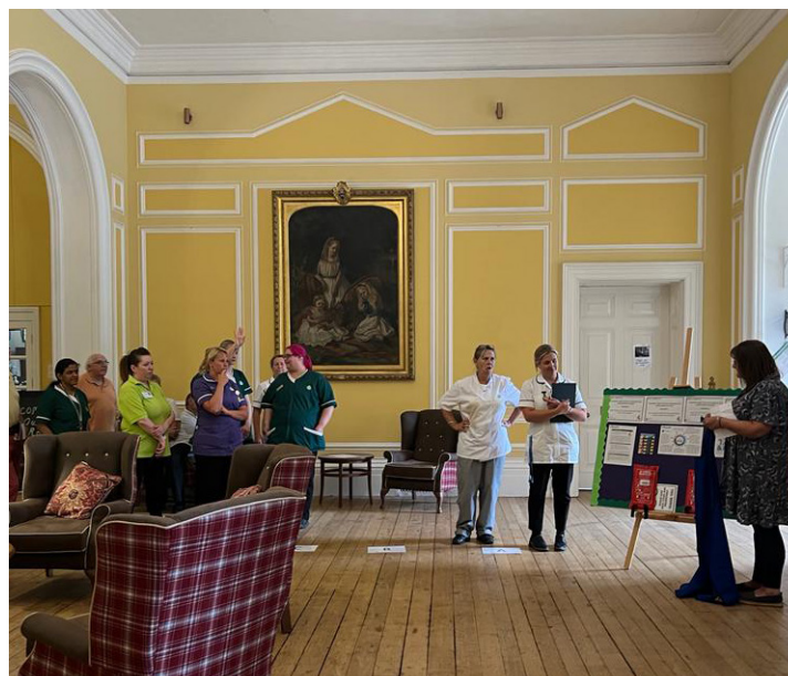
The team at Stowlangtoft Hall taking part in an interactive fire drill scenerio alongside visitors to the home

These have been well received by the team and we have also seen visitors taking part in the exercise to help them feel more comfortable on what would happen in the event of a fire if they were in the home. If you would like to take part in one of our scenario exercises, please speak to a member of our management team.