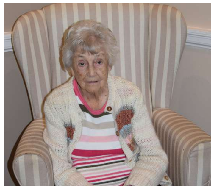
Resident at Brandon Park who helped create the poem

Here is an acrostic poem the group wrote to celebrate Advent.