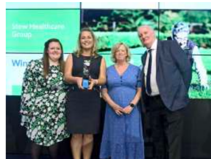
Best for Innovation in Care Award

The first was 'Best Innovation in Care' for our two massive projects of 2021 - The Maple Memory Centre at Brandon Park and the COVID Designated Unit at our Cedars Place home in Essex - a huge achievement for these two homes.