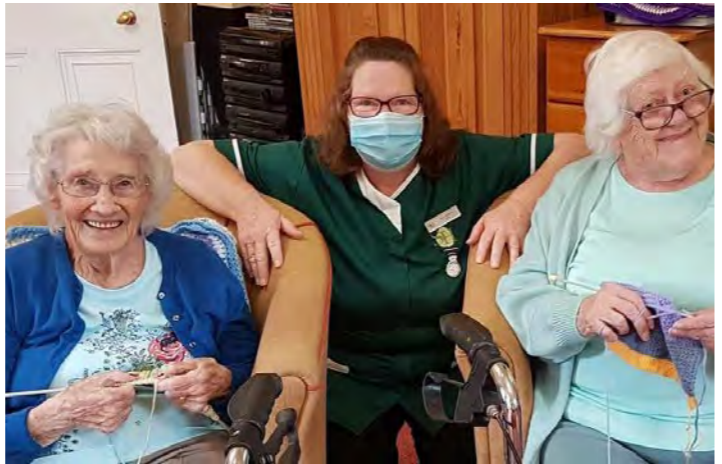
The Knitting Box Team at Ford Place Nursing Home

For more information please search 'The Knitting Box' on Facebook.