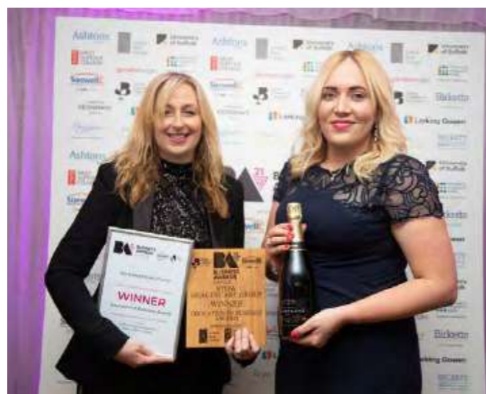
Winner - Stow Healthcare Group Education in Business Award