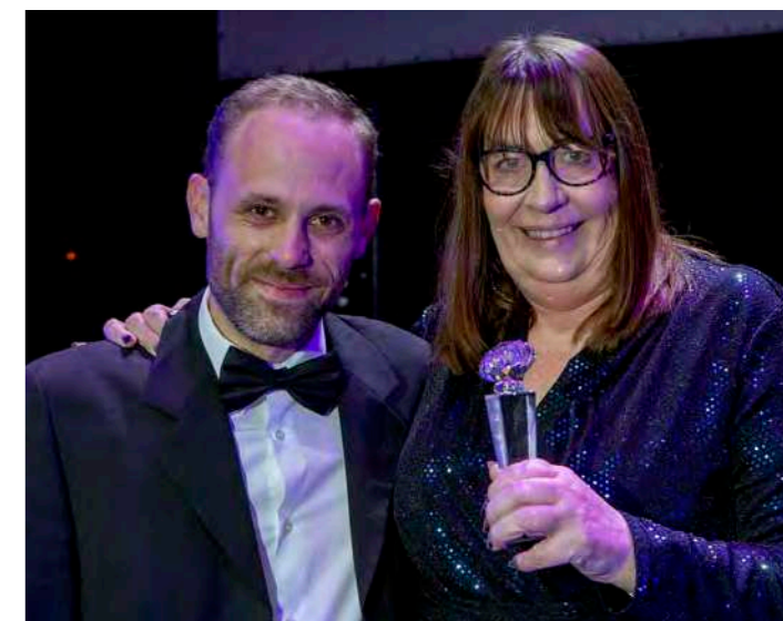
Winner - Halstead Hall Care Team Dementia Care Team Award

The success built for Halstead Hall at the Caring UK Awards in December where the Team were named 'Dementia Care Team of the Year'.